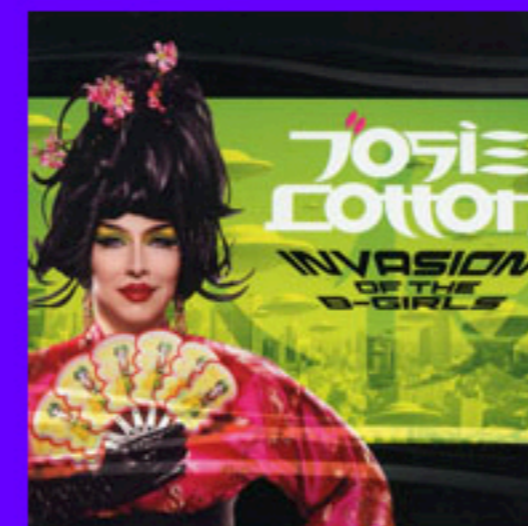
JOSIE COTTON on Scruffy Records