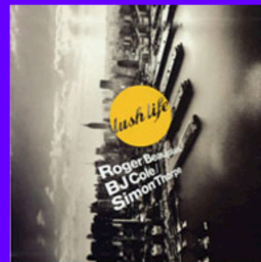
LUSH LIFE on Untied Artists