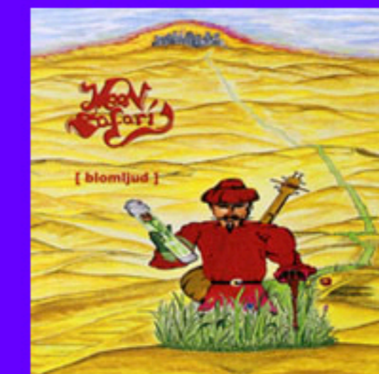
MOON SAFARI on Blomljud Records