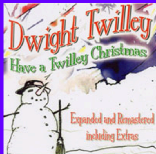
DWIGHT TWILLEY on Gigatone Entertainment