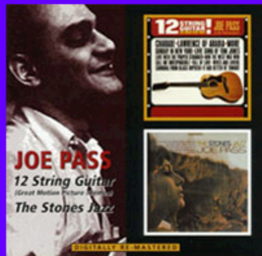
JOE PASS on BGO Records