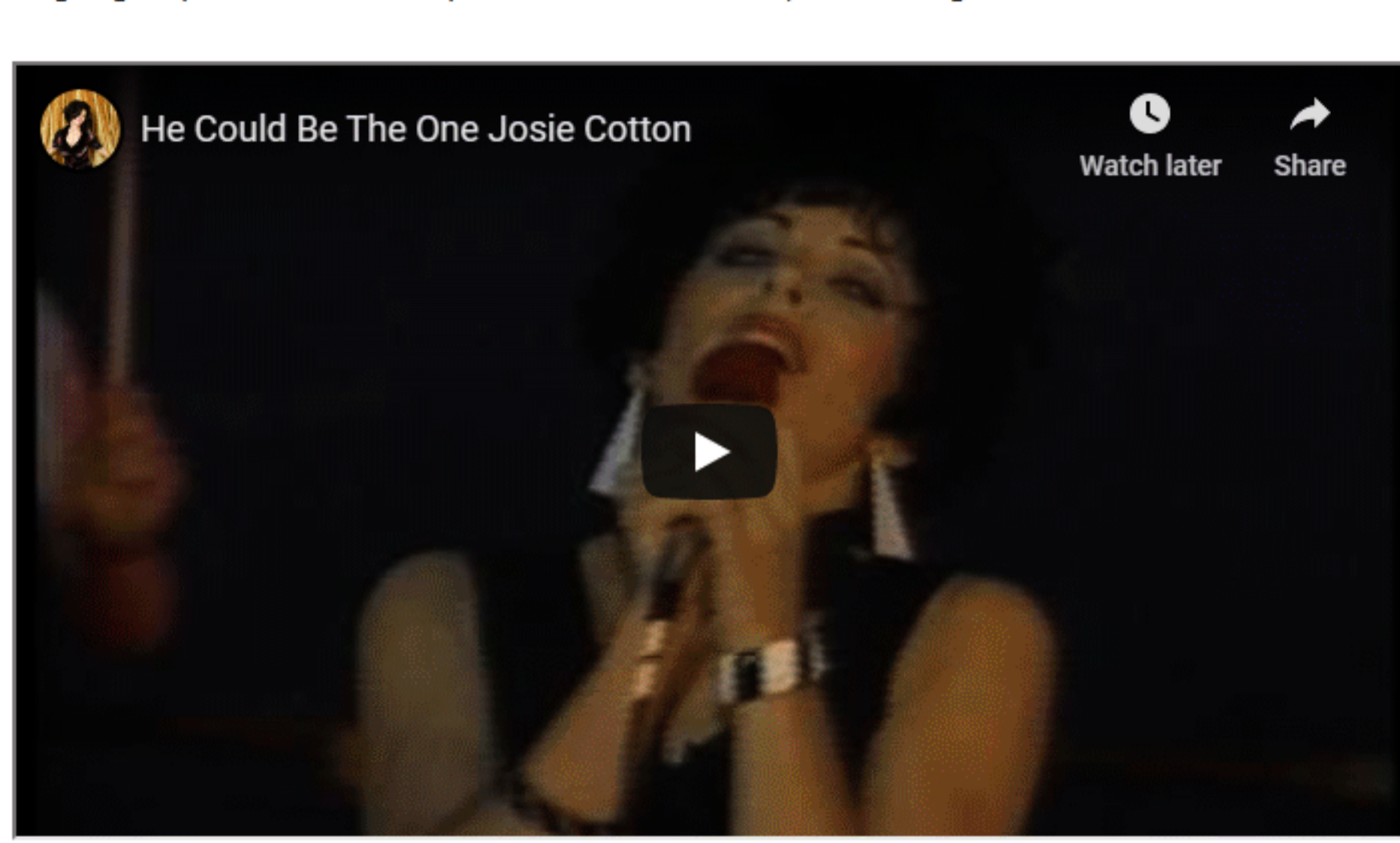
Josie Cotton "He Could Be The One"

Re-emerging last Fall with the release of a critically-acclaimed new single "Ukrainian Cowboy," Josie kicked off a new era in her already illustrious and storied musical history. Riding on a crest of renewed vitality and excited media attention, she followed up the single with Everything Is Oh Yeah! , an album of finished tracks that hid dormant in an attic until the Stranger Things producers came knocking, looking for some '80s-inspired music. Dusted off and remixed, Everything Is Oh Yeah! received thunderous applause from fans and press alike. All Music Guide raved, "Cotton is a weirder version of Cyndi Lauper with a voice big and versatile enough to match." Boing Boing added, "[ Everything Is Oh Yeah! ] is both a time capsule and a time-travel fantasy that bounces from new wave to surf to girl group to neo-rockabilly... there are some fun, mid-'80s gems in here for sure."